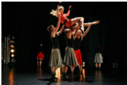
PND presents Circuits