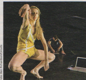
Patricia Noworol Dance Company

6. Urban Street Art Festival: 25.10.–6.11. Flottmann-Hallen/ KuZ, Herne; Schauspielhaus, Bochum; www.pottporus.de