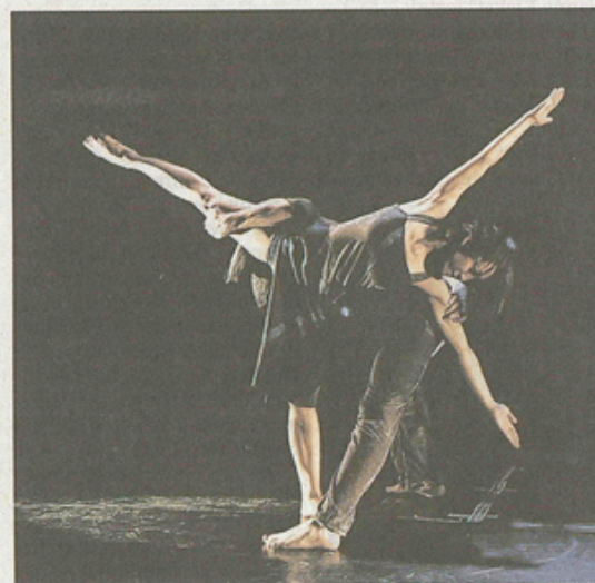
Tanzfigur aus „Circuits“.

Monotone Geräusche und Klangkollagen sorgen beim Zuschauer für Beklemmung. Und das scheint zu gefallen: Nach etwa einer Stunde Tanztheater gibt es teilweise ständige Ovationen und lang anhaltenden Applaus für die PND.